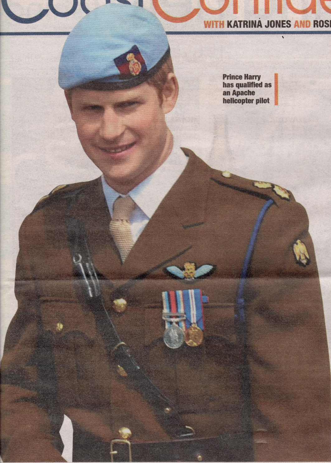
Prince Harry has qualified as an Apache helicopter pilot